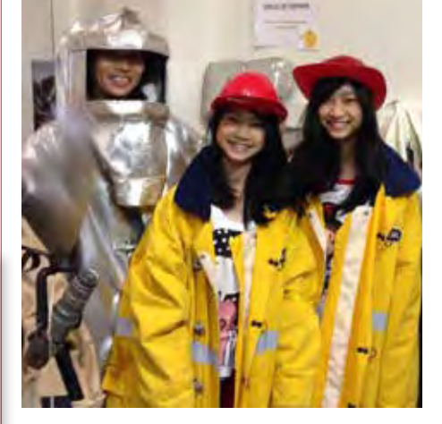
Today we had a family from Toronto visiting the CFFM. While here, they participated in the Culture Days scavenger hunt and also tried on some gear in the dress-up corner!

The Fire Mark is the Newsletter of the Canadian Fire Fighters Museum. 95 Mill Street S., Port Hope, ON L1A 3W4 www.firemuseumcanada.com Facebook.com/FireMuseumCanada