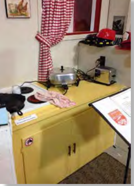
We have an interactive display about fire safety at the CFFM. Bring your kids by and see how many hazards they can spot in the Museum kitchen! Fire Prevention Week continues until October 10th 2015!