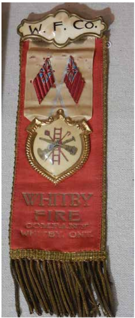
Above: A very attractive convention ribbon from Whitby, Ontario. Reversible to be worn as a memorial ribbon.

If you have an artifact or photo involved with Canadian fire fighting history that you'd like to donate, please contact us. Tax receipts are available for appraised items.