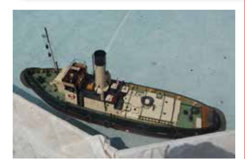
Above: There were meticulously crafted model boats of all sizes and types on display as well as a fantastic working miniature steam engine.

Next year's Model Boat Day is already booked with date to be announced. Hope to see you there!.