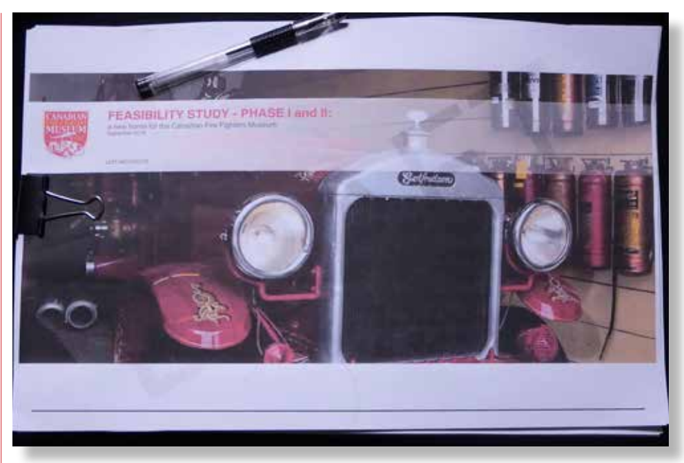
Above: Front cover of CFFM Feasibility Study written by Lett Architects. Over 80 pages of information.

An earlier planned presentation to Council had to be delayed as the Board needed more time to go over the study for final approval. Due to some scheduling conflicts it now looks like the Council meeting on November 1st will be the soonest we can present it publicly.