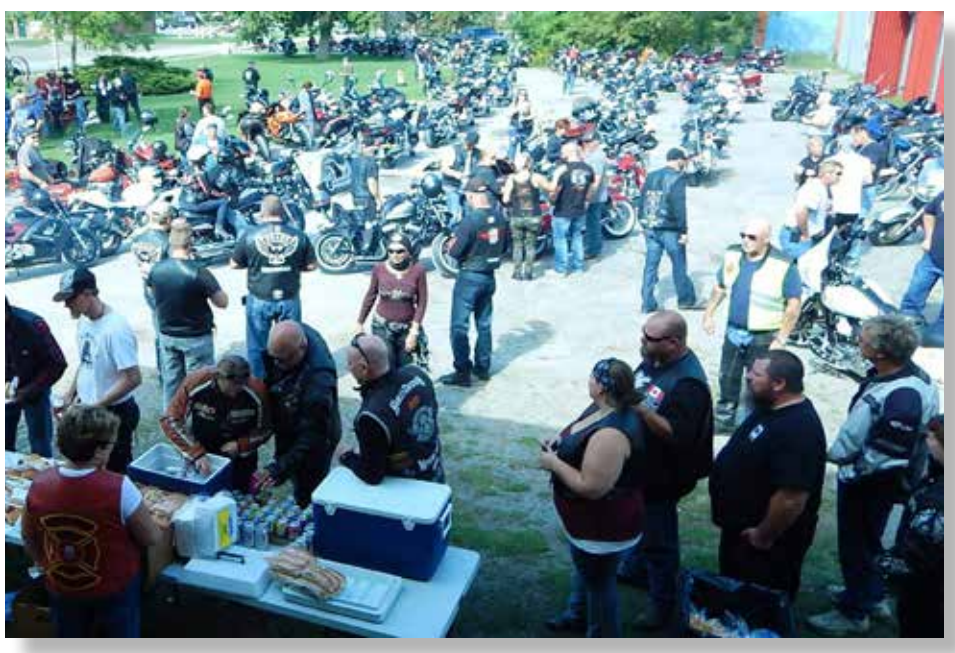
Above: Members of the Firefighter Red Knights Motor Cycle Club at their yearly charity ride event head-quarters on the CFFM grounds. Almost 100 fabulous motorcycles fill the parking lot! Read more >>