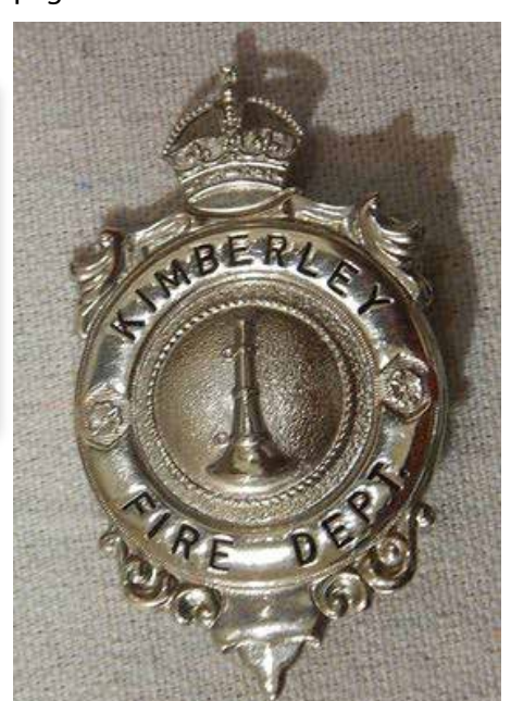
Above: A lieutenants cap badge from Kimberley BC. Circa unknown, but the King's Crown would place it between 1901 and 1952.

he Museum is constantly receiving new items for display. Here are a few recent gifts. Others can be seen on the "New Acquisitions" page of the web site.