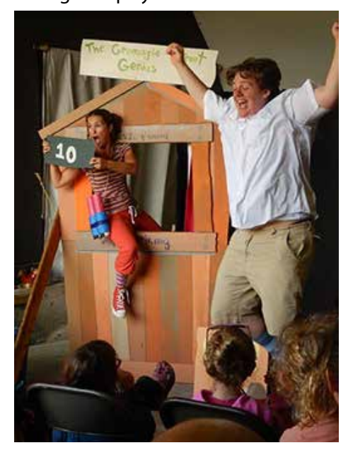
Above: Audience enjoys a scene from the play which was fun and lively and had a great message about bullying!

It was a very successful day for the Museum with over 85 people visiting. Holding an event like this was a first for CFFM. It meant some exhibits in the truck area needed to be rearranged to create space—the 1941 GMC and the air raid pumper (whose tire was repaired the previous day by Northumberland Tire at no charge) outside. We moved the Kingston pumper over close to the 1926 Gotfredson and pushed everything else up against the back wall to create a big enough space to stage the play.