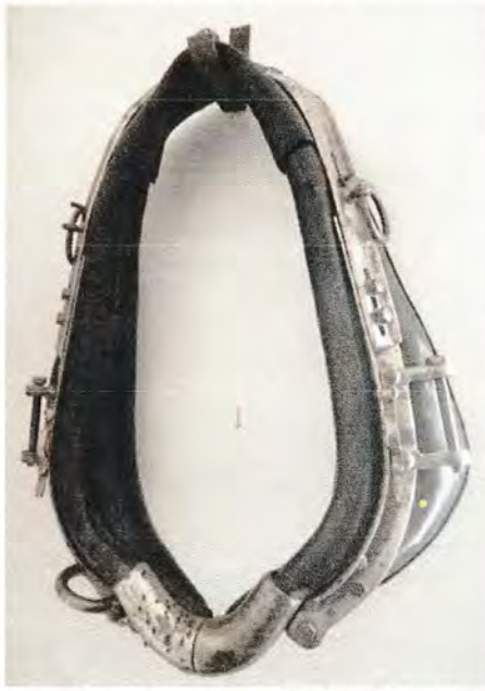
Above: A "quick hitch" hose collar allowed fire fighters to quickly hitch up the horses to the rolling stock to get to the fire sooner.

A Fire Department horse collar. Built small and light because these fire department horses already had to pull heavy loads at high speeds. The collars were unique in that they had a hinge at the top allowing them to open at the bottom. They would hang open from the ceiling of the fire hall and when the alarm sounded the well-trained horses would walk up and stand below them. The entire harness was then lowered onto the waiting animals and quickly connected. This resulted in amazing quick "turn-out" times.