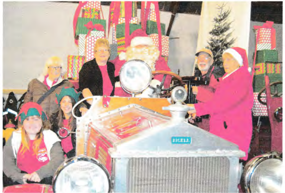
Above: Santa visited the Fire Fighters Museum! After appearing in his traditional spot at the tail end of the Port Hope Christmas Parade, Santa got himself right over to the Museum where he had his photo taken with a big crowd of visitors who enjoyed hot chocolate while touring our cold (unheated) Museum!